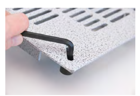
TopSet™ leveler with Liebert handle key inserted