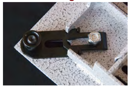
Patented Actuated Frame Levers