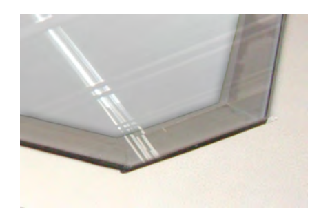
Replaceable ClearView Scratch Resistant Inserts